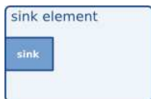
Figure 5-4. Visualisation of a sink element

Sink elements are end points in a media pipeline. They accept data but do not produce anything. Disk writing, soundcard playback, and video output would all be implemented by sink elements. Figure 5-4 shows a sink element.