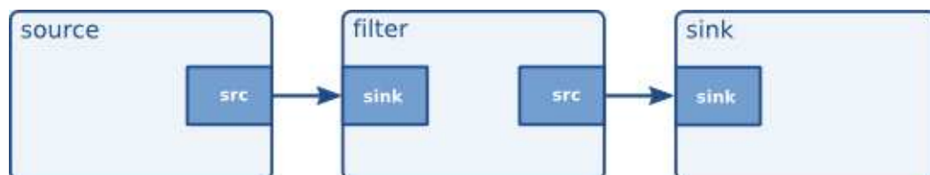
Figure 5-5. Visualisation of three linked elements

By linking these three elements, we have created a very simple chain of elements. The effect of this will be that the output of the source element (“element1”) will be used as input for the filter-like element (“element2”). The filter-like element will do something with the data and send the result to the final sink element (“element3”).