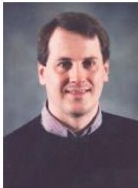
Figure 1—A JPEG image of the author.